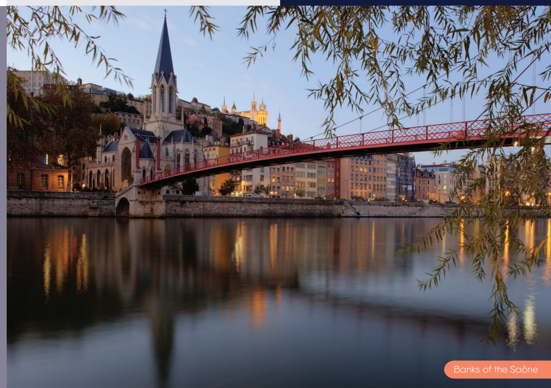
Banks of the Saône